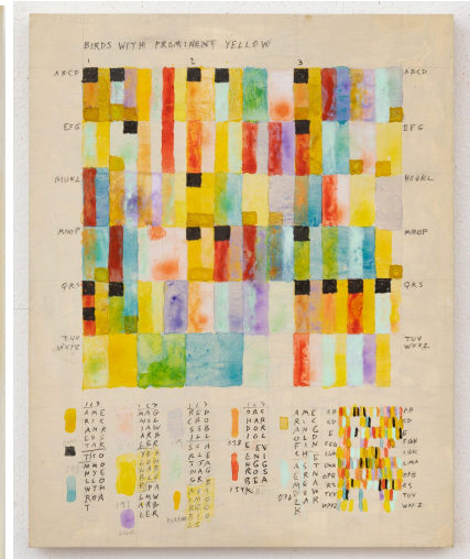
LEFT: Debra Ramsay, Prothonotary Warbler , 2022, 5.25" x 8.25" x .75", acrylic on cast acrylic panel