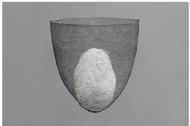
The Offering Bowl 05, 2022 Artist's hair, horsehair, feathers, glue 6 1/2" h x 6" w x 6" d