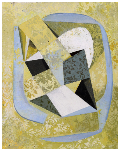
Left: Outlier , 2021, acrylic on canvas, 30" x 24"