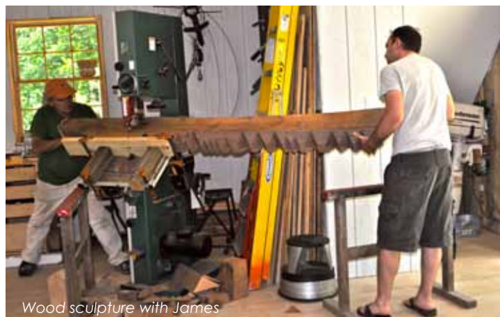
Wood sculpture with James

Move over Robert Sabuda! Participants will learn very basic pop ups that can be built upon to create bigger and more complex structures. Watching the paper fold and pop up just the way you want is like magic and the things you can make. The sky's the limit. Limit: 10 students