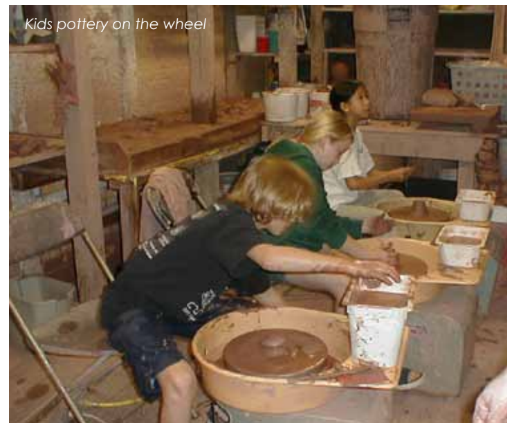
Kids pottery on the wheel